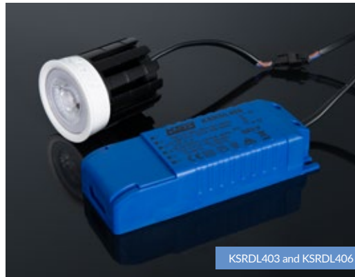
KSRDL403 and KSRDL406